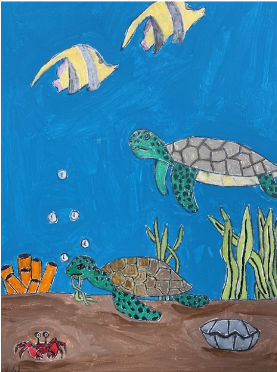
Under The Sea Acrylic 12X16 Canvas $15