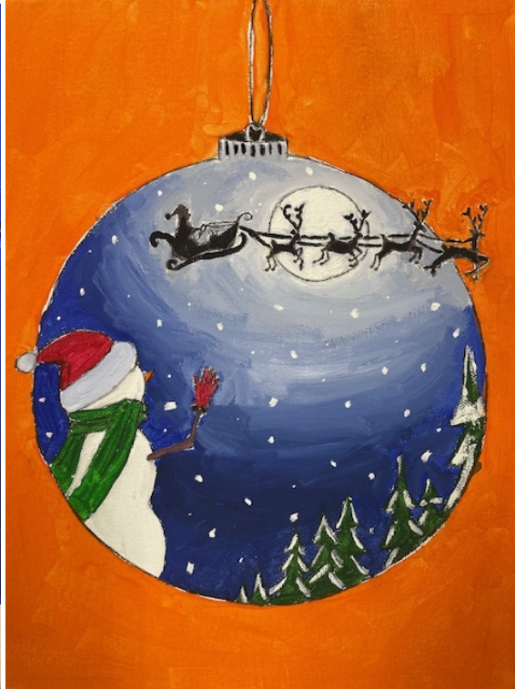
Santa is Coming Acrylic 11x14 Canvas $10