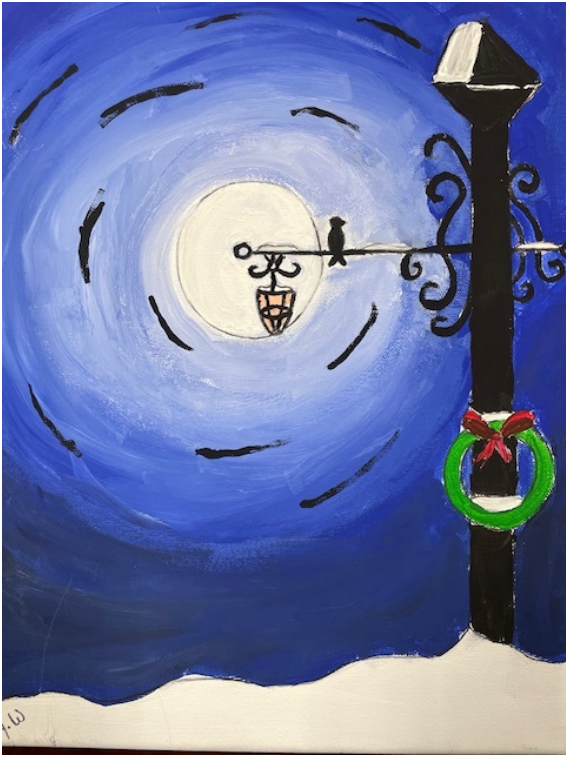
Silent Night Acrylic 11x14 Canvas $10